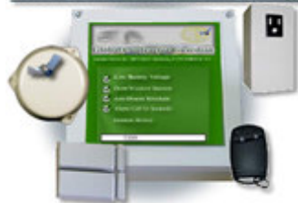
Global Contractor Guardian Package

Global Contractor Guardian™ is a wireless security system that provides security capabilities and remote activation around the world. Global Contractor Guardian™ monitors for illegal entry, smoke, GPS coordinates and low battery voltage.